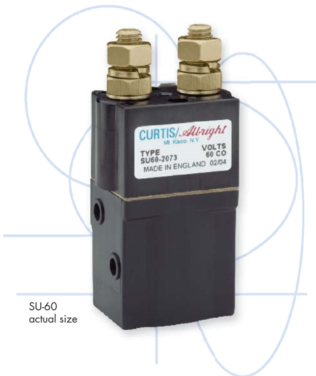
SU-60 actual size